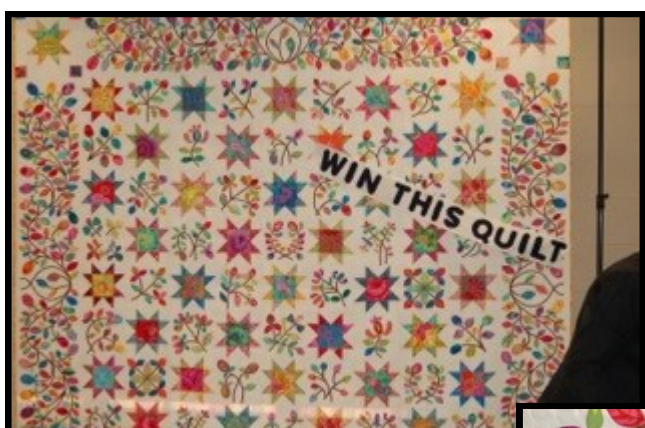
East Cobb Quilters: "Georgia Celebrates Quilts" Raffle Quilt Visits CRQG!