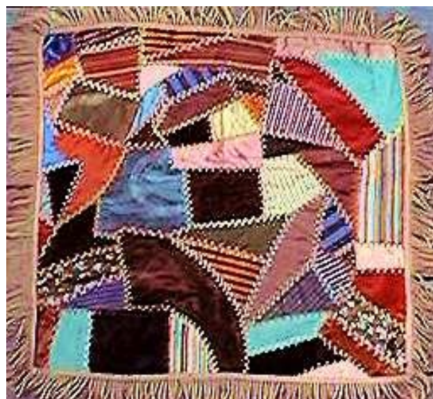
AN ANTIQUE CRAZY QUILT PILLOW

Membership Dues For 2014 Are Now Due: $30. Membership Form Is Attached or Can Be Downloaded From Website Under Membership.