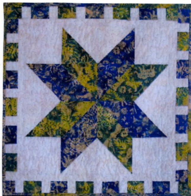
Eight Point Star (36x36)

1 fat quarter of a favorite color 1/2 yd. of contrasting fabric for background. (you will have a lot left over) Matching thread