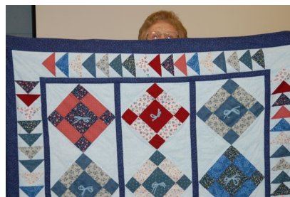
Jane Wilding—Flying Geese