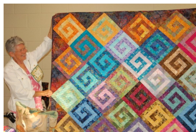
Right: Charlene Shanks Top right: Althea's puzzle