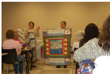
Below: Pineapple Trash to Treasures