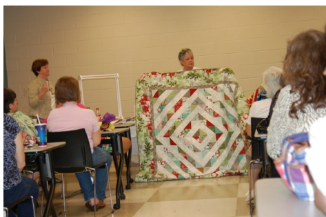
Above : Tiny Stitches

Respectfully submitted, Phyllis Carpenter