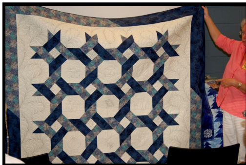
←Vickie Hecht Close Up View→