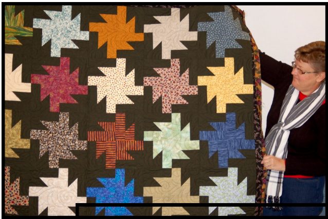
← It's a double-header for Marge Frost