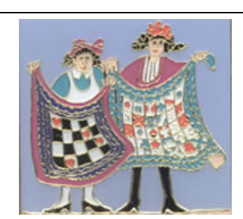
Quilts, like friends, are different, colorful, fun, warm and comforting--And you can never acquire enough of either.

If interested contact her at 770-942-8472 for further information.