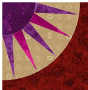
This is an example of the NY Beauty block