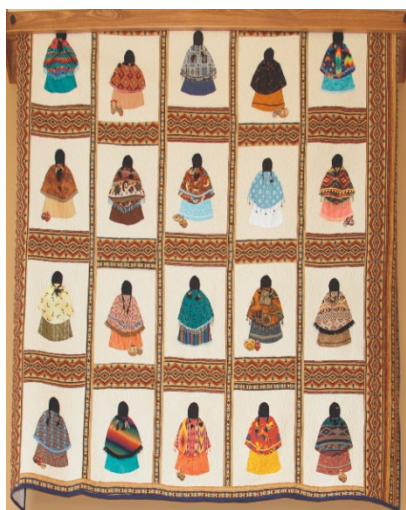
Rita Perez The Gathering

Reminder! The Douglas County Library display has been confirmed for June and July. Please contact Caryl Knox if you are willing to volunteer to help set up the display or have an item(s) small or large you are willing to share for that time period. You must have a label on your item even if it is a "stick on address" label. The display case is kept locked with no access. Take a peek in our historian album to see what CRQG has done in the past. Let's give it our best shot and "show off" some of your precious creations. Set up will be June 1 at 10 a.m., Selman Drive, Douglasville Library. Let's have a great time, dazzle the community with our creativity and DO LUNCH!