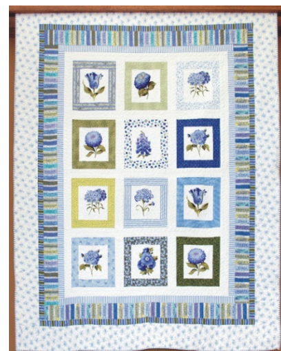
Betsy Montemayor Betsy's Blue Posies

Tubs are available at every Guild meeting for depositing items for the annual R'Auction. Remember as you do your spring cleaning to set aside those items you plan to donate.