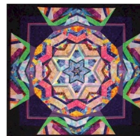
56" x 56" Kaleidoscope Quilt 2002