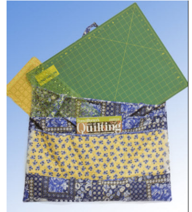
November Day Raffle

Two raffles will be held in November, one each for the day and night meetings. The day meeting will feature a ruler bag as shown to the right. Not only does the winner take home the rulers, the cutting mat, the bag, and the magazine, but there will be two surprises that will go along with this raffle item.