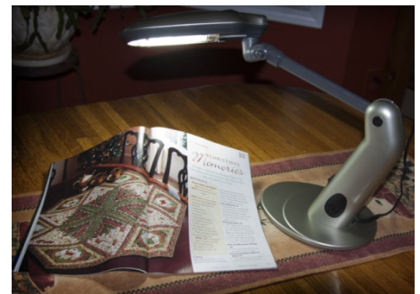
November Night Raffle

The R'Auction, a major Guild fund raiser sponsored by this committee, was held on October 28. Members and friends gathered to dig through R'Auction items to find just the things they were looking for. During the course of the evening, several bidding wars broke out, much to the delight of participants. The R'Auction was a huge success; it earned $863.50 for the Guild and it's many activities that will take place in 2011.